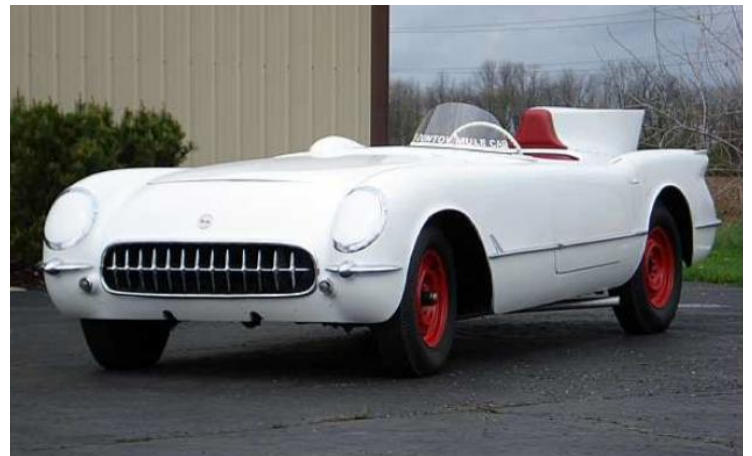
1955 Corvette EX87